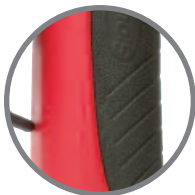
Ergonomic, composite handle with textured soft grip