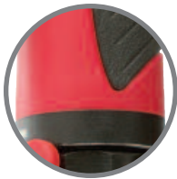
Light weight aluminum reinforced nylon housing