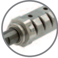
1 HP motor