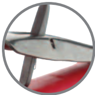
Contoured throttle lever with lock