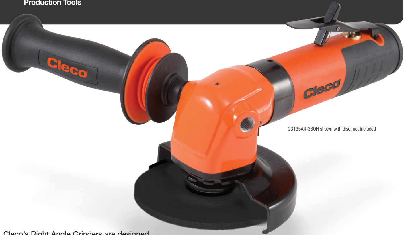
C3135A4-380H shown with disc, not included

Cleco's Right Angle Grinders are designed for rigorous use and long life, containing the features and power that are perfect for the most demanding applications found in foundries, shipyards, machine shops and rail car manufacturing.